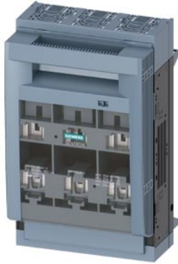
SENTRON, Fuse switch disconnecter 3NP1, 3-pole, NH1, 250 A, for Rittal busbar system 60 mm, flat terminal, Cover level 32/70 mm