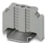
End clamp, width: 9.5 mm, color: gray