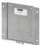
Mounting plate for SFNT switches

Mounting plate - FL PA SFNT 5-8 - 2891012